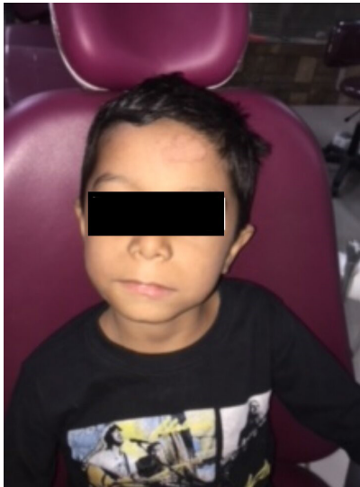
Fig. 1: Extra-oral view showing facial asymmetry (swelling on right side)

Under local anesthesia, the deciduous second molar and permanent first molar were extracted. A preventive approach can be followed to preserve the developing mandibular erupting tooth. Enucleation of the entire cystic lesion with curettage and normal saline irrigation was done, followed by suitable sutures, and the specimen sent for histopathological examination. No complications were observed. Patient was discharged & advised regular follow-up (2 weeks interval).