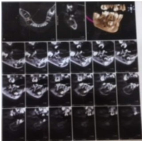
Fig. 3: Lateral & occlusal view showing bony involvement & expansion of buccal plate in lower right back region of jaw.